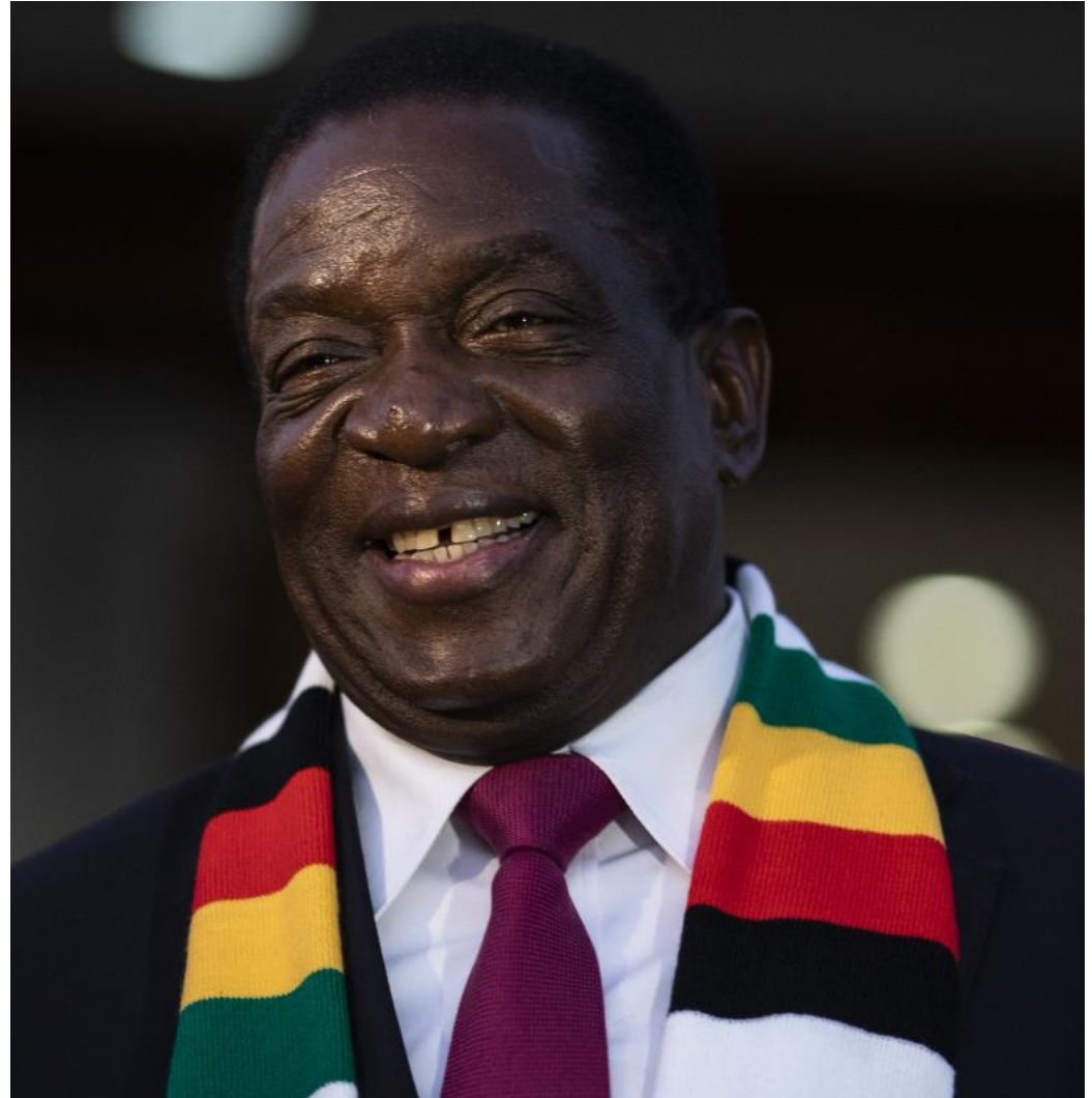
H.E. Emmerson Dambudzo Mnangagwa, The President of Zimbabwe