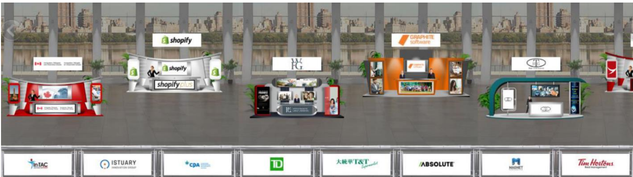
Virtual Exhibition Hall