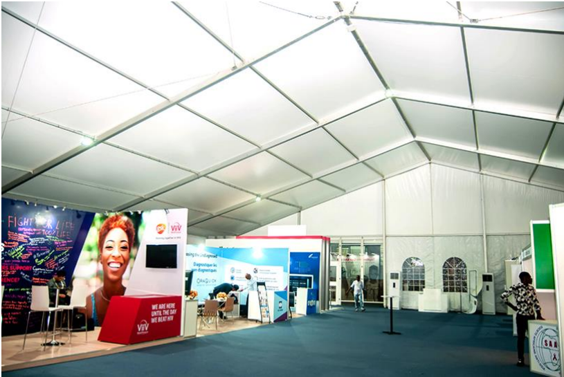
ICASA In-person Exhibition Hall