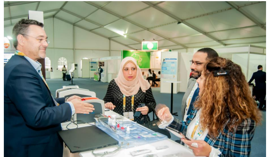
Exhibition at ICASA Rwanda