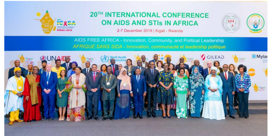
DIGNITARY GROUP PICTURE, ICASA 2019 OPENING CEREMONY

Bank: ECOBANK GHANA LIMITED Branch: A&C SHOPPING MALL, EAST LEGON Physical Address: PMBGPO ACCRA – GHANA Account name: SOCIETY FOR AIDS IN AFRICA – ICASA 2023 PARTNERSHIP/SATELITE/EXHIBITION Account number: 2441000304906 Ecobank’s Swift Code: ECOCGHAC Ecobank’s Correspondent Bank: DZ BANK, FRANKFURT GERMANY Swift Code for Correspondent Bank: GENODEFF Account Currency: US Dollars Reference: Purpose of transfer should be indicated on reference field. Bank code: 13-01-00 Branch code: 13-01-07 NB: (i) All local and overseas charges must be borne by the Sender. (ii) Kindly always send us proof of transfer or swift advice for our notification/follow-up and record. Thank you.